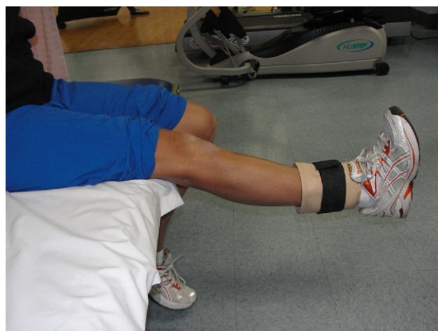
Figure 2. Open kinetic chain exercise.

Dillman [10] proposed that the classification be determined by whether the terminal segment in the chain is movable or fixed and whether it bears a load. An activity with