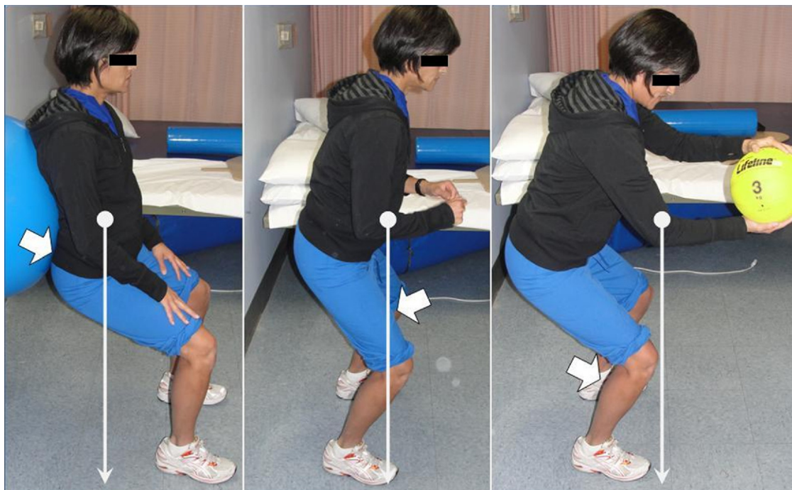
Figure 4. Effects of moving the center of gravity over the joint axis on muscle recruitment pattern in closed kinetic chain activity.

the center of gravity over the joint axis can directly influence muscle recruitment.